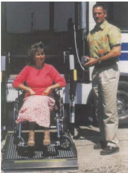
Shown with optional wheelchair lift package.

Beauty is more than skin deep when it comes to Crusader. A bus designed and built like this stands first in line for comfort and durability. No wonder Crusader leads the way for short transit needs. And no wonder Champion is the preferred bus vendor for North America's leading hotels and shuttle operators.